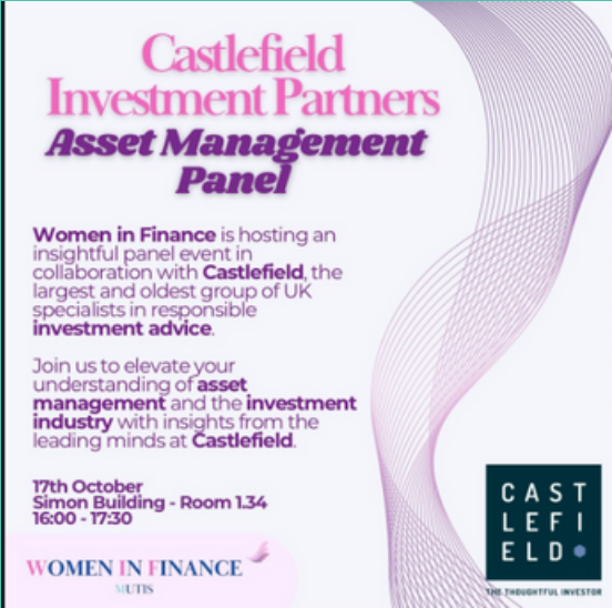
University of Manchester talk